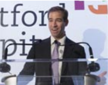
Hartford Mayor Luke Bronin